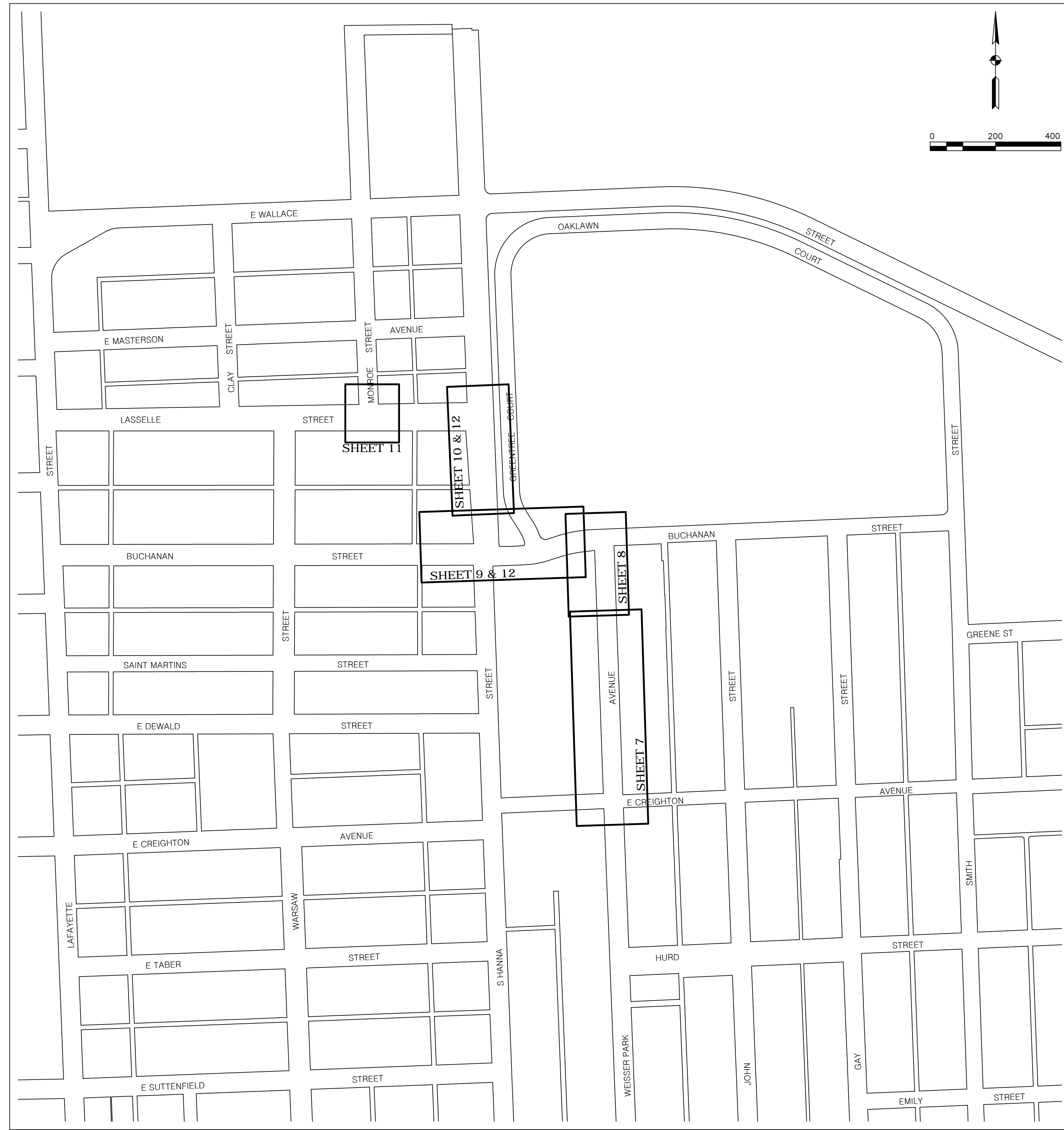
SHEET LAYOUT INDEX

PLANS PREPARED BY: FORT WAYNE CITY UTILITIES ENGINEERING CITIZENS SQUARE 200 E. BERRY ST., STE 250 FORT WAYNE, IN 46802