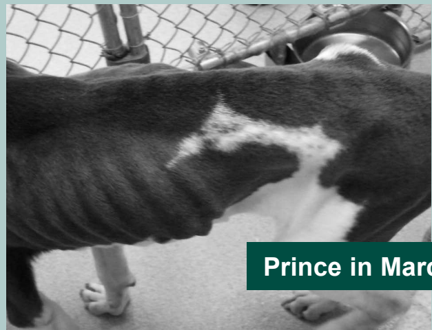
Prince in March

Prince represents the glimmer of hope that remains alive among dreadful circumstances. He has now gained over thirty pounds and has been adopted into a loving home. The road to recovery will not be smoothly paved as he is now faced with the challenge of learning how to be a dog. We are thankful for the opportunity to help dogs like Prince and for the families willing to adopt.